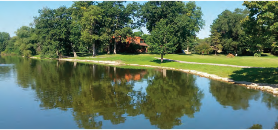
Meyers Lake shoreline rehabilitation before (above) and after (below)